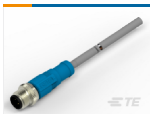
TE Part # T4151120004-005 RPC-M12-MS-4CON-PUR-5.0